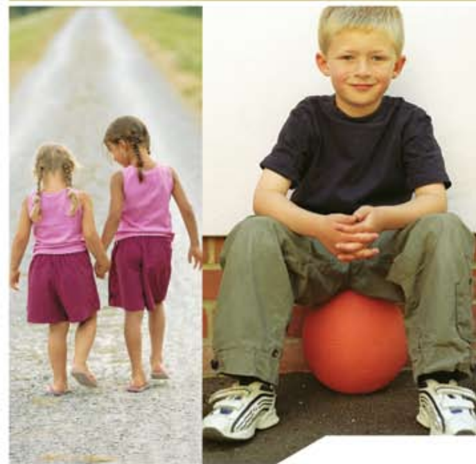
CHANGING LIVES FOREVER